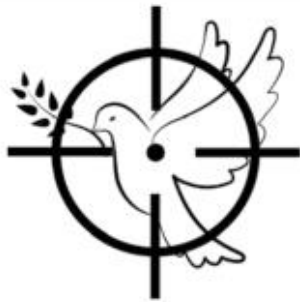
Still in the crosshairs

Advocating for social justice since 1990